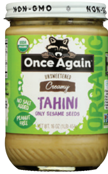
Once Again Organic Tahini

Spreading integrity since 1976, Once Again is a 100% employee-owned company that produces clean ingredient nut & seed butters and snacks. Our passionate employee owners take pride in fueling healthy lifestyles with small-batch, high-quality products crafted as close to homemade as possible.