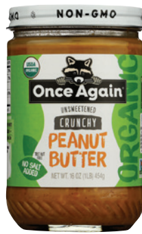
Once Again Organic Peanut Butter