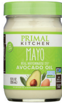
Primal Kitchen Mayo