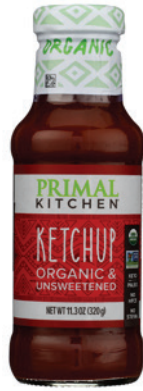
Primal Kitchen Organic Ketchup

Add bold, crave-worthy flavor to the real foods you love with Primal Kitchen Organic Unsweetened Ketchup and Mayo with Avocado Oil. Our premium pantry staples are made with real ingredients like organic California-grown tomatoes and cage-free eggs for a classic taste that kids and parents love. No artificial sweeteners and no nonsense!