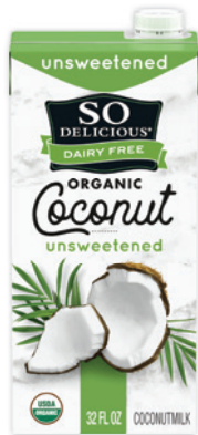
So Delicious Organic Coconut Milk selected varieties