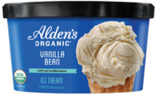
Alden's Organic Organic Ice Cream selected varieties