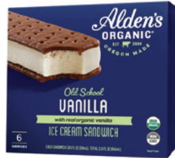
Alden's Organic Organic Ice Cream Sandwiches

Made with organic ingredients and a focus on responsible sourcing, Alden's Organic is a Certified B Corp committed to supporting communities—bringing rich, creamy ice cream to your table while doing things the right way.