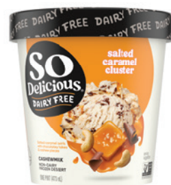
So Delicious Plant-Based Frozen Dessert selected varieties