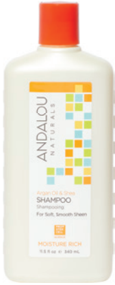
Andalou Naturals Shampoo selected varieties