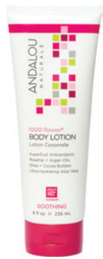
Andalou Naturals Body Lotion selected varieties