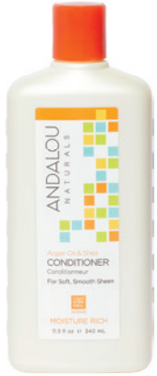
Andalou Naturals Conditioner selected varieties