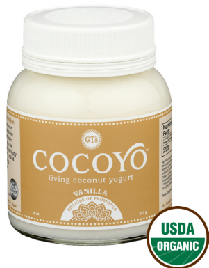
GT's Organic Coconut Yogurt (selected varieties)