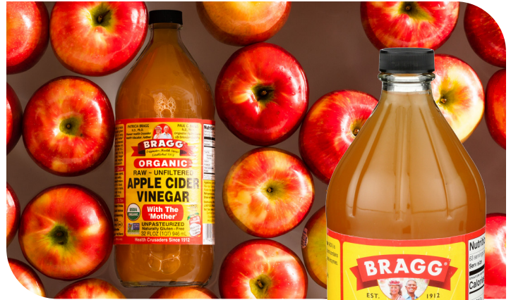
Bragg Organic Apple Cider Vinegar