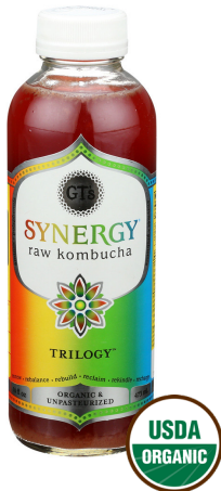
GT's Organic Kombucha (selected varieties)