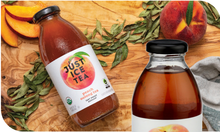
Just Ice Tea Organic Ice Tea (selected varieties)